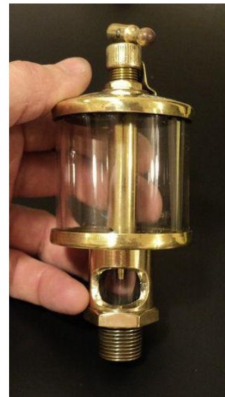
Brass/Glass Drip Oiler

Of all the early American engine manufacturers, the career of the Nelson Brothers Company is one of the most difficult to trace. Their engines were sold under more than 75 different brand or trade names. This Nelson Brothers engine was in a very sorry state when our volunteer took on the task of restoration. Many of the parts were missing, broken, or severely worn. Not knowing the history of the engine, it was physically evident that it had been run hard for many years and could run no more. The other tractor volunteers called this engine a “lost cause”, attaching a whistle to it so it could make some noise when the schoolchildren visited. Read the story on the SRHF website about how this engine was brought back to life.