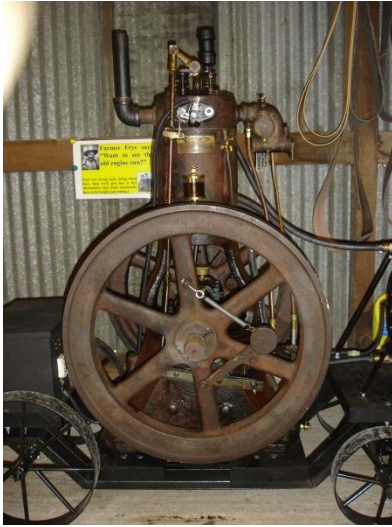
Peerless Motor Company 6 h.p. Hit-and-Miss Engine

a very slow rate, generally about one drop every 8-10 seconds.