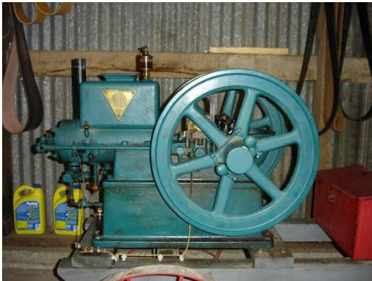
De Laval Separator Company Model Alpha, 2 ½ h.p., Hit-and-Miss Engine